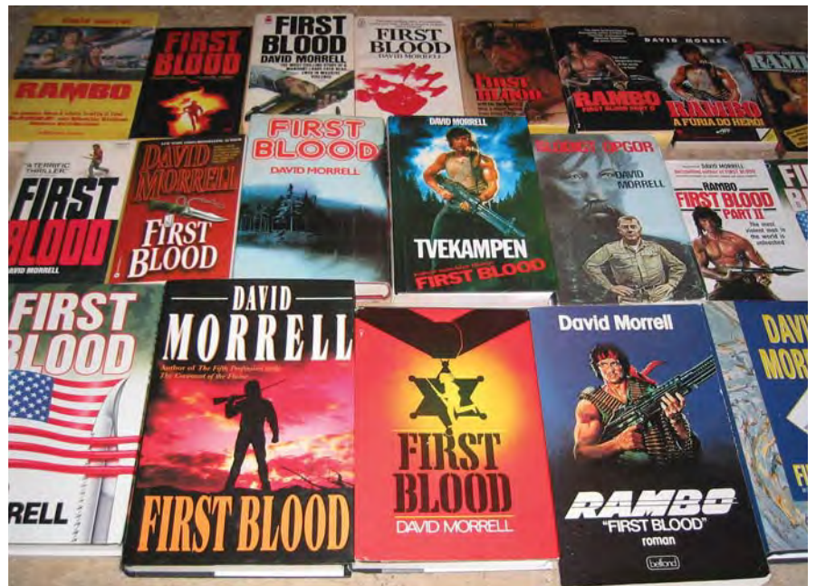
Since it was first published as a hardback book in 1972, First Blood has never been out of print and has been translated into 30 languages, a number of which are represented here. See if you can guess which is the original cover. The answer appears at the end of the story.

One reason Morrell said the knife wouldn't have worked in the novel is because when Rambo breaks out of jail and escapes on a motorcycle, he's stark naked—not exactly the best circumstances